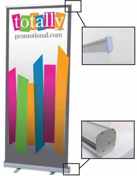
Detail View Front