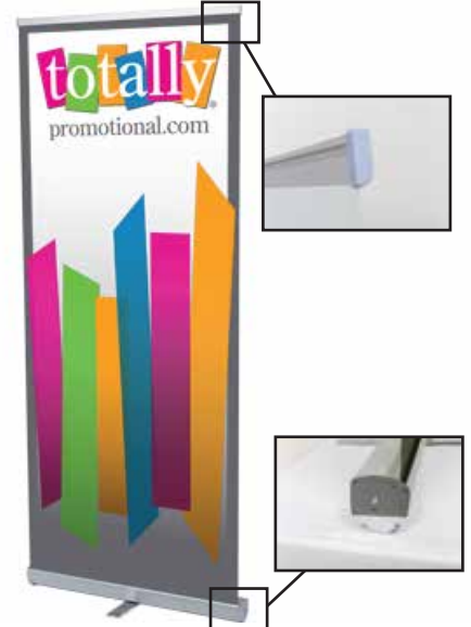
Detail View Front