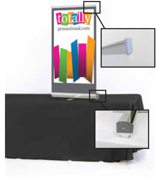
Detail View Front