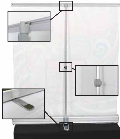
Detail View Back