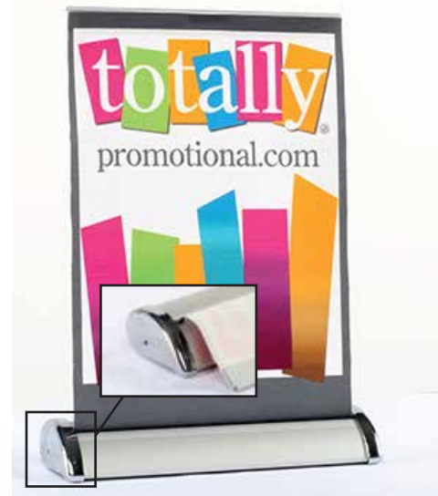
Detail View Front