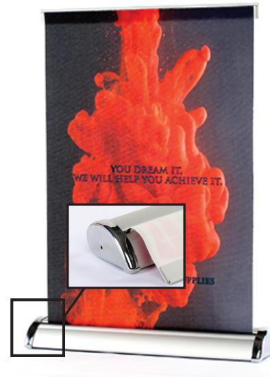
Detail View Front